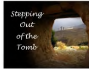
Easter Sunday April 31, 2010 © Urban Contemporary Services & 10 Urban Traditional Services 10:00-11:00am Santee Branch

Who might you invite to hear the great news of Easter? Think of who you can invite to join you as we celebrate on Easter morning. Invitations are available to help you make your personal invitation easy and memorable.