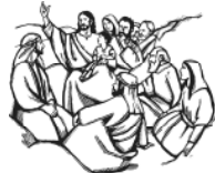
Sermon on the Mount