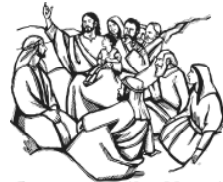
Sermon on the Mount