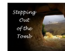
Easter Sunday April 21, 2019 9:00am Contemporary Worship & 11:00am Traditional Services 10:00-11:00am Easter Brunch